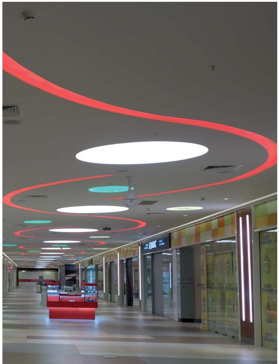
Lotus Mall, Russia