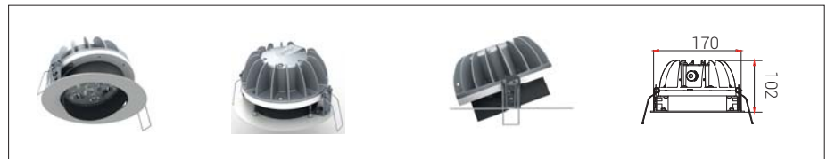
11: Deep movable*