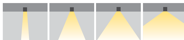
XN: Extra Narrow Angle M: Medium Angle W: Wide Angle XW: Without lens