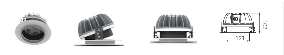
12: Deep recessed movable*