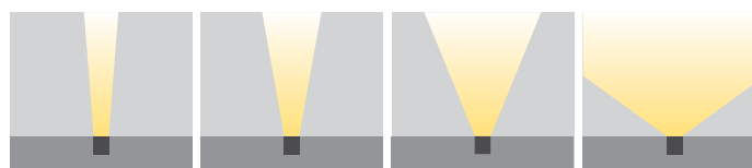
XN: Extra Narrow Angle N: Narrow Angle M: Medium Angle XW: Without lens