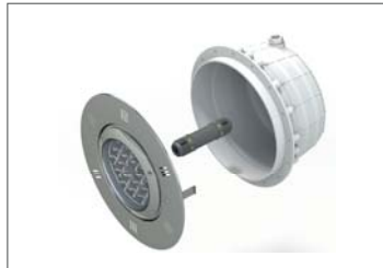
34600946: Mounting Box