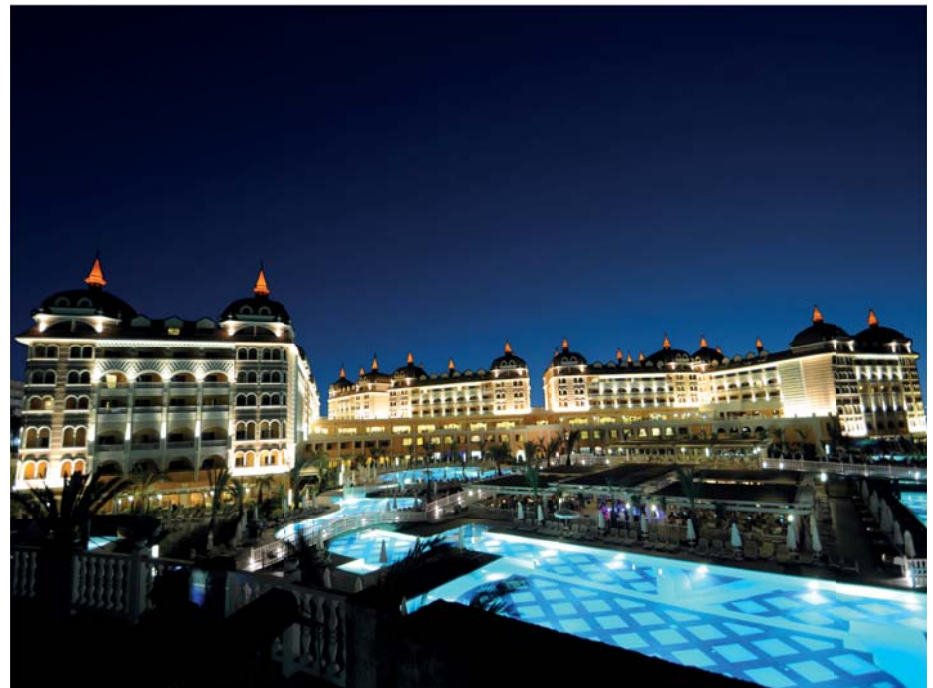
AL Hamra Palace Hotel, Antalya