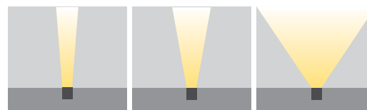
XN: Extra Narrow Angle N: Narrow Angle W: Wide Angle